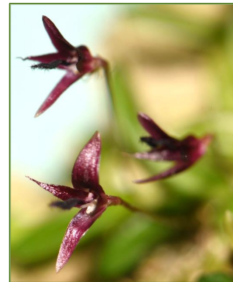
Bulbophyllum macphersonii – L & B Dobson