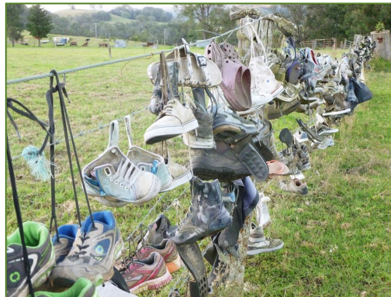
'Boot Hill' Allyn River Forest Road