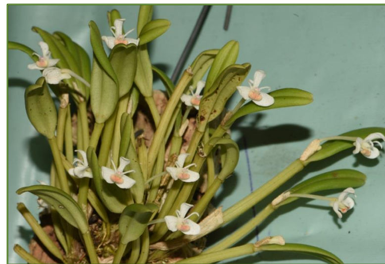
Cadetia taylorii