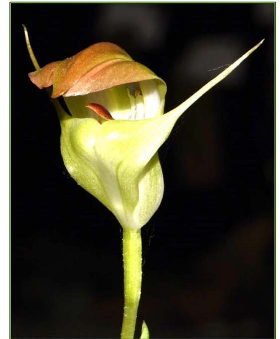
Pterostylis baptistii