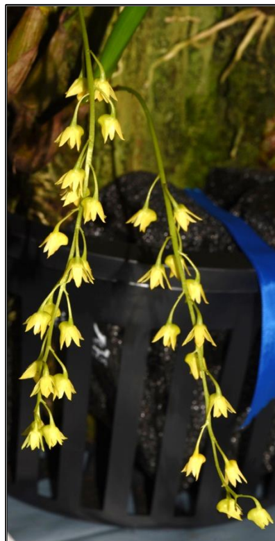
Dendrobium monophyllum