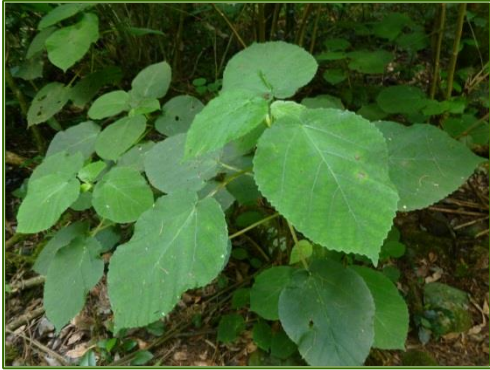
Urtica incisa – Stinging Nettle