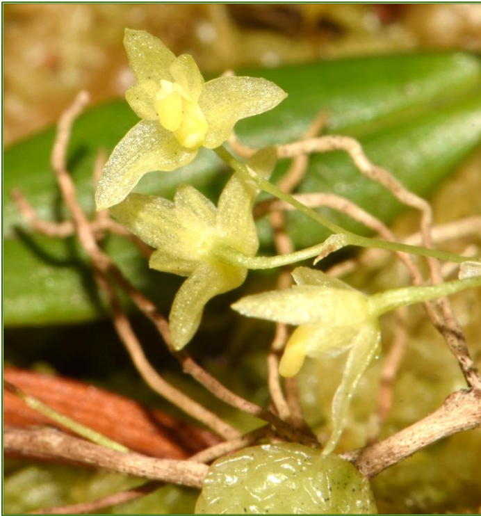
Bulbophyllum exiguum – Jolan Leforestier