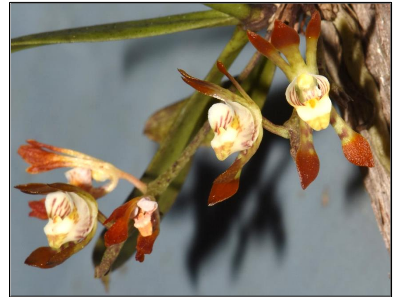
Sarcochilus dilatatus